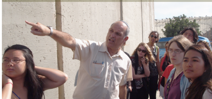
Tour with Danny Tirza, IDF's Chief Architect of the Security Fence - View more photos*

To date, undergraduate and graduate students from prestigious universities across six continents , along with diplomats and professionals in various fields, have participated in CME. Learn about their experiences in our: video* , photo gallery* , testimonials* , and Facebook Page* .