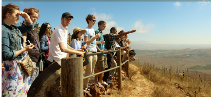
Observation point into Syria from the Golan Heights - View more photos*