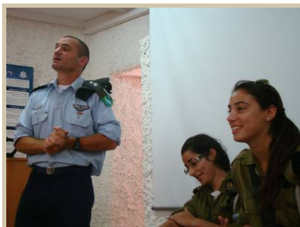
Photo: Encounter with soldiers at an Army Base

Study of the role of young people in Israel today. Visit to a military base in Israel, including a meeting with young soldiers of university age. Presentation of volunteer projects created by university students for the development of conflict zones and the integration of different sectors of the population. Reflection on youth's role in the shaping of a country.