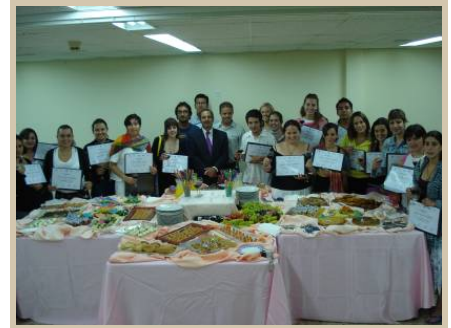
Photo: Closing ceremony at the International Institute of Leadership

Beginning of complementary programs to Egypt and Jordan