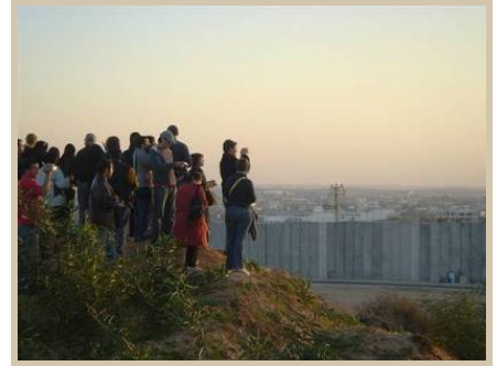
Photo: View of Gaza.

Visit to the city of Sderot, including a meeting with authorities and local residents living under daily terror. Meeting with Jewish settlers evacuated from Gaza in 2005 to hear their stories and opinions with regard to possible future evacuations from the West Bank.