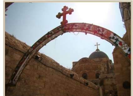
Photo: Church of the Holy Sepulcher

Meeting with a Christian priest who will share his views on coexistence from a Christian perspective.