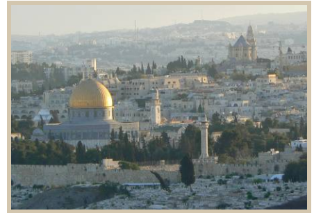
Photo: Jerusalem's Old City

Introductory Session: "Coexistence at the meeting point of people, religions and civilizations." Analysis of a reality comprising different viewpoints based on different justifications, such as religion, history, international law, security, human rights and geopolitical, social and religious aspects.