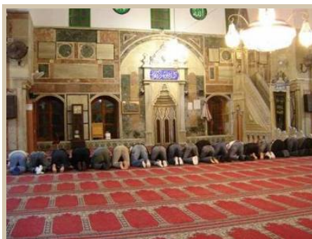
Photo: Arab prayer at Acco's Great Mosque

Visit to a Mosque and encounter with an Imam, who will explain Islamic principles and values as well as the Islamic vision of coexistence with other religions.