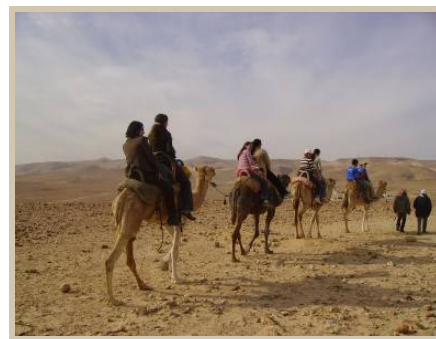
Photo: Camel ride in the Judean Desert.

Analysis of the relations between Israel and Jordan and the mutual benefits of their peace treaty. Descend to the lowest point on Earth and swim in the Dead Sea.