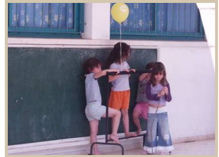
Photo: Arab and Jewish children in the mixed school Kfar Kara.

Organizations such as youth movements with Arab and Jewish members and educational projects of Jewish students in Arab cities and the Forum of Bereaved Parents, an organization whose members are Palestinian and Israeli parents who have lost children in the conflict, which promotes dialogue as a solution.