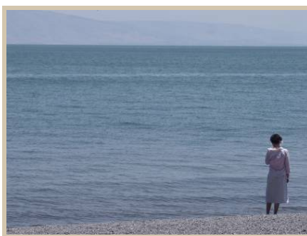
Photo: Sea of Galilee

Study of the origins of Christianity. Visit to the Galilee, cradle of the Christian religion. Tour of Nazareth, where Jesus was raised, a city which today has an Arab majority. Visit to the Basilica of the Annunciation and Saint Joseph Church; the Jordan River, where Jesus' baptism took place; the Shrine of the Beatitudes, where Jesus gave a sermon on the Mount; and the Sea of Galilee, where Jesus was said to have walked on water.