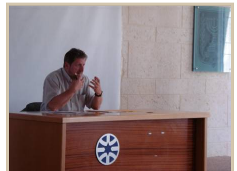
Photo: Lecture at the Israeli Ministry of Foreign Affairs.

Discussion panel on the vision of the State of Israel and its future, with participants from several political parties and sectors of Israel's population.