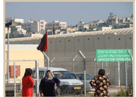
Photo: Inspection point between the West Bank and Israel

Panoramic view of the narrowest part of the State of Israel. Discussion of the strategic problem of territorial depth. Visit to Kfar Saba, a typical Israeli town, and a reflection upon the normality of life in a country that has suffered terrorist attacks and multiple wars.